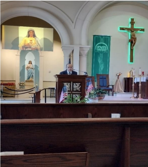
The Patriotic Rosary was recited by our Financial Secretary.

Patriotic Rosary- The Rosary was recited on 9 November in honor of our Veterans & Nation's sacrifice recognizing all 50 states and famous quotes throughout our history.