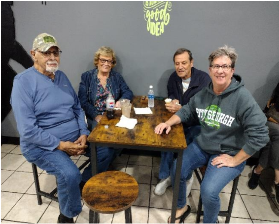
Ice Cream Social- A good time for Fellowship and good Food